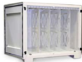
Vertical Art Dividers