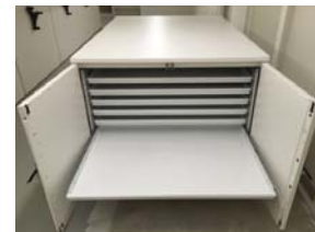
Full Width Pullout Shelves with Extension Slides