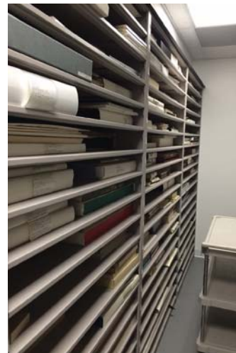
Archival Material on Aurora Shelving