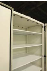
Full Width Adjustable Shelves