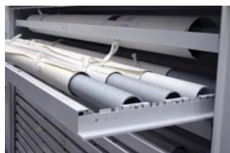
Rolled Textile Drawer