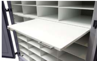
Pullout Work Surface