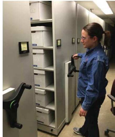
Archival Material on Mobile Carriages