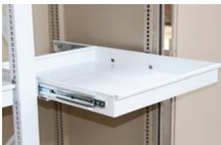
Drawers with Full Extension Slides