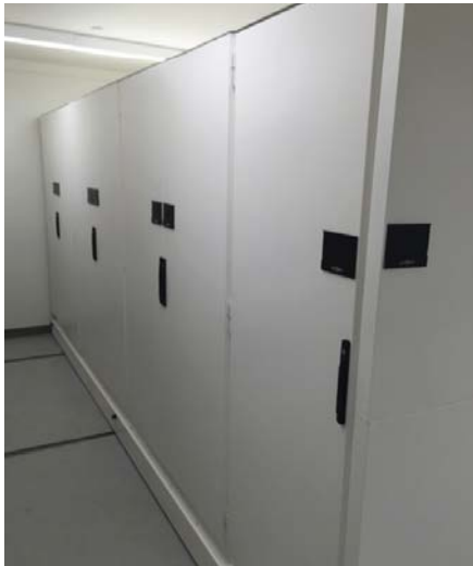
Museum Cabinets on Mobile Carriages

In addition to Museum Collections Cabinets, Aurora has many other storage solutions such as Art-Stor Art Rack, space efficient Aurora Mobile, sturdy Quik-Lok Shelving and Aurora Library Shelving for research centers.