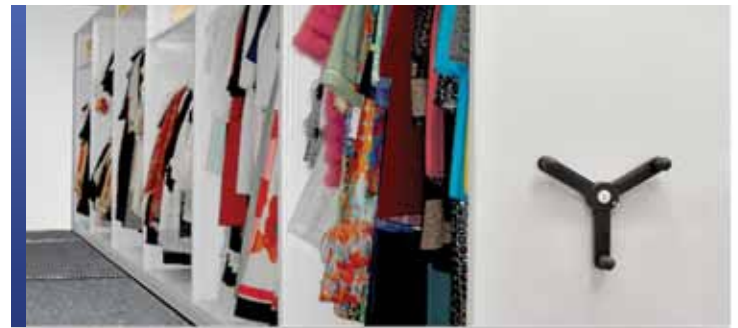
Mobile Storage for Garment Collections

As we treasure historic garments and textiles because they document art, craftsmanship, and have a very immediate connection with people of the past, Montel understands that, as with all art and artifacts, preservation starts with appropriate storage. From our extensive range of mobile and stationary shelving systems and storage cabinets, we can optimize and customize textiles-related storage.