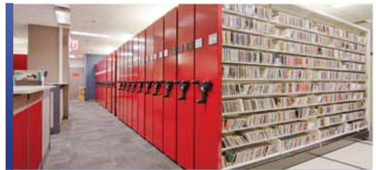
Audio Storage with Mobile & 4-Post Shelving

Whatever the nature or format, Montel offers a film and audiovisual collection storage solution specially designed to ensure the media's preservation and conservation. From mobile storage systems to stationary shelving systems, our custom-designed storage solutions, with an array of features and accessories, will provide maximum security and organization for your collection requirements.