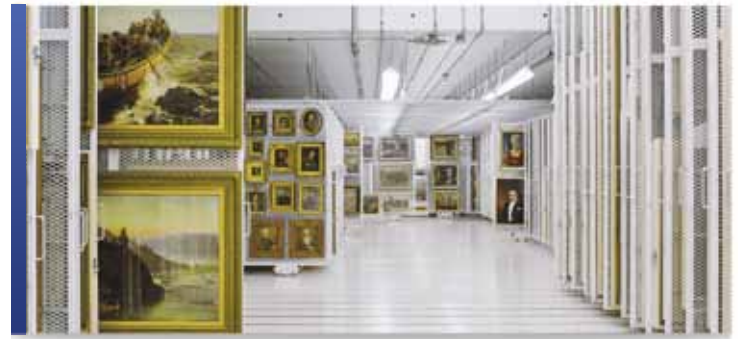
Floor-Mounted Pull-Out Storage Panels

Facilitating the management of collections and assisting to prevent costly damage, Montel's sliding art rack panels have become the storage panel system of choice for numerous renowned museums and galleries.