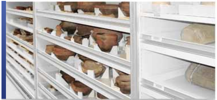
Heavy-Duty Drawers for Larger Artifacts