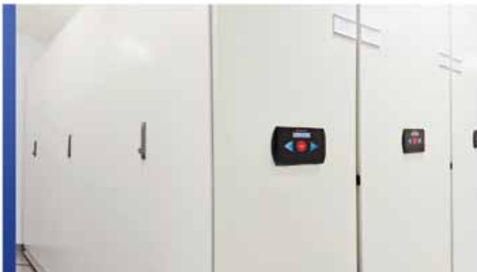
Powered Mobile Storage

To conserve space or create new available space, our mobile storage systems offer the latest design, security and safety features to house your unique collections. With high-density powered mobile storage systems, getting the most out of your allocated space is a key consideration—but guaranteeing safety is also a must. A state-of-the-art collection-care system, SafeAisle® will put your mind at ease on both counts. Its LED Guard Technology™ is aimed at providing the utmost in storage safety, for your collections and personnel. Or, select Montel's signature Mobilex® mechanical assist storage system, with its patented mechanical safety brake, to optimize the storage footprint, while maximizing your priceless collections.