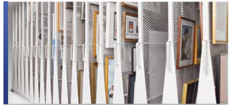
Mobile Storage Panels