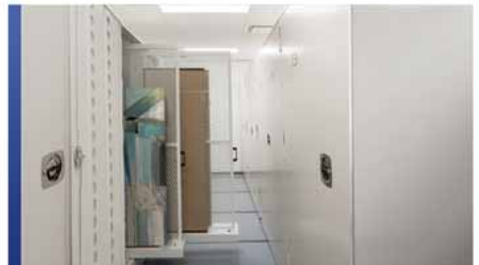
Textile Storage Cabinets