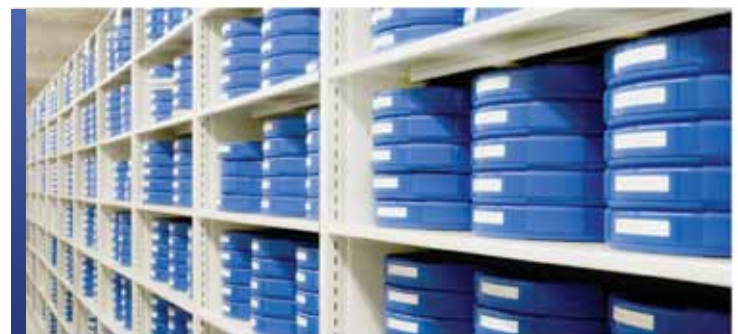
Specialized Storage for Film Collections