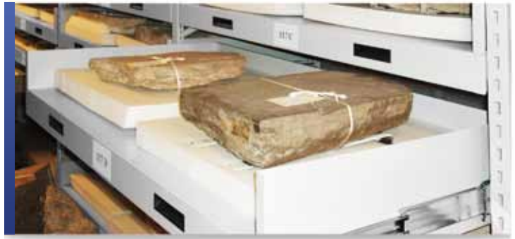
Artifact Collections on Custom-Drawers

With infinite adjustability and flexibility, Montel offers its exclusive and uniquely designed SmartShelf storage shelving. With a wide selection of shelves and accessories, SmartShelf enables innovative and safe storage solutions for all types of collections. As a stand alone application or mounted to our mobile carriages, this shelving system will ensure that artifacts and 3D object collections are properly stored for long-term protection.