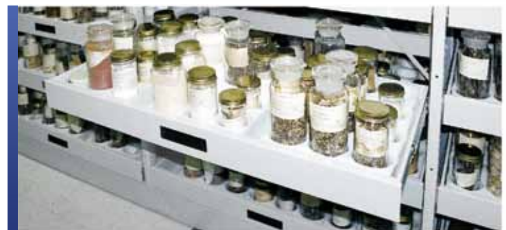
Drawers for Specimen Collections

By integrating our broad range of high-density mobile and stationary shelving systems and cabinets into your collections management, you can optimize and customize specimens-related storage at your institution. For the enjoyment of future generations, Montel provides collection-care storage systems allowing a safer, more effective method of preserving these precious biological specimens.