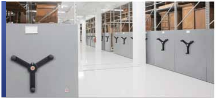
Oversize Collections with Mobile Storage

Montel's fixed or mobile wide-span shelving systems ensure the safe storage of oversized and heavy artifacts. The uprights, supports, and shelves of Montel's 4D shelving units are designed and engineered specifically for the Museum market, as they exceed industry standards for flexibility, sustain heavier loads, and accommodate objects of varying heights.