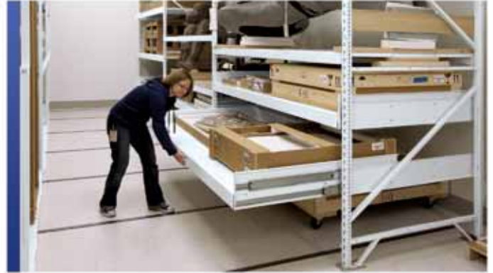
Specialized Drawers for Artifact Collections

Whether for mobile storage solutions, or traditional stationary applications, allow us to share the unique details of Montel's exclusive shelving systems that offer superior flexibility, strength, and rigidity. No matter the shape and size, look to our SmartShelf® 4-post hybrid shelving, our Aetnastak® cantilever shelving, or our 4D wide span racking for the maximum preservation and security of your museum collections.