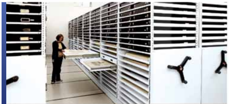
Prints & Drawings Collection with Mobile & 4-Post Shelving

Providing a good environment, safe handling and effective storage conditions are critical to preserving your print and drawing collections. Since best to store paper items flat, rather than folding and unfolding, which can lead to creases and tears, Montel offers a wide array of storage methods to carefully protect your collection.