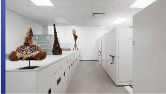
Conservation Storage Cabinets