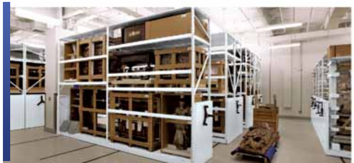
Mobile Storage with 4D Wide Span Racking