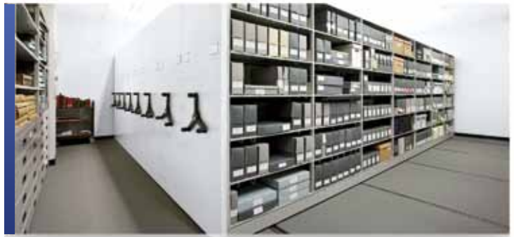
Archive Storage with Mobile & 4-Post Shelving

Montel understands the importance of collections care and preservation needs in today's museum. When it comes to creating innovative and cost-effective solutions for rare book, manuscript and archive collections, Montel leads the way with versatile mobile and stationary storage solutions that make effective use of limited museum storage areas while facilitating efficient shelving and retrieval.