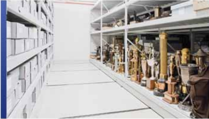
Mobile Storage with 4D Wide Span Racking