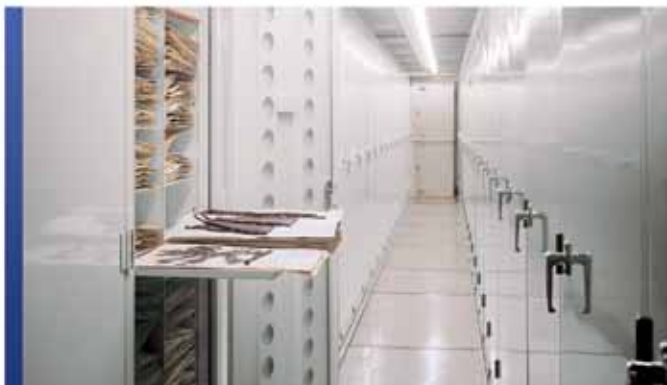
Herbarium Storage Cabinets

Whatever your storage collections, Montel can offer a versatile array of carefully crafted cabinets designed to accommodate your special needs. With a flexible design and a wide range of options, our extensive selection of cabinets will protect your most valuable collections, ideally for use of mobile storage systems to save floor space.