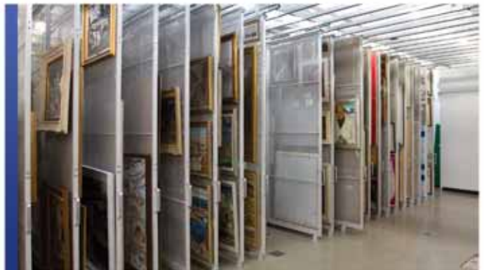
Ceiling Suspended Pull-Out Panels