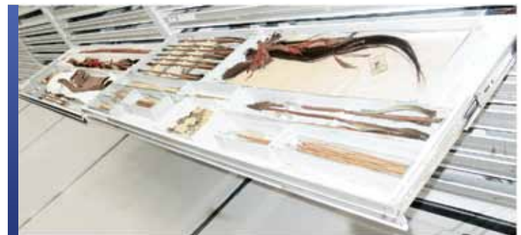
Historical Specimens on Sliding Drawers

Some of the most fascinating creatures ever to inhabit the Earth can be seen today only in the form of preserved museum specimens. In fact, this collection presents a unique storage challenge to museums, due to the unusual sizes and shapes of specimens, as well as the potential method of preservation in fluids. This 'wet collection' creates its own unique challenges, and its proper storage is critical for safety. Handling is not as simple as other dry artifacts. One way to help make the job easier is to have the right kind of storage system.