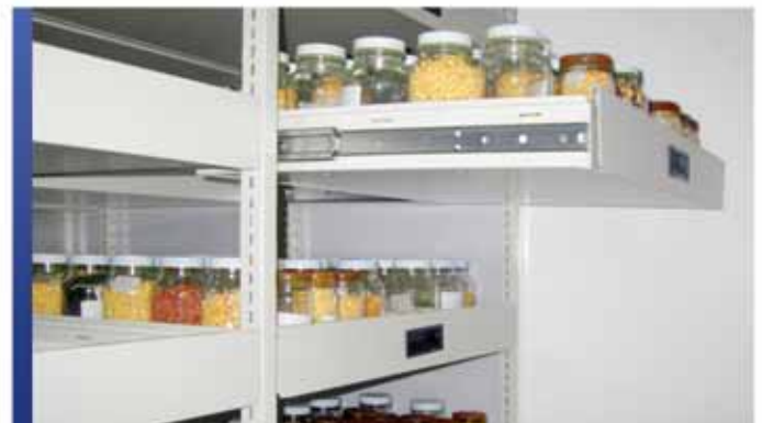
Sliding Drawers for Specimen Collections