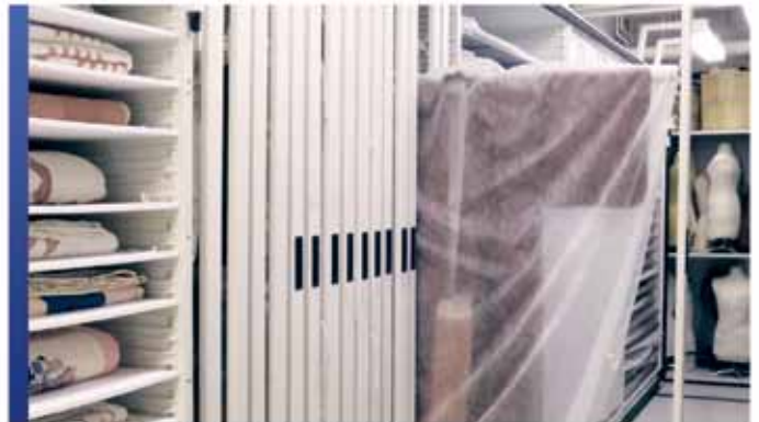
Specialized Storage for Garment Collections

From Anthropology to Zoology, Montel's storage products make intelligent use of your storage space to smoothly manage artifacts, specimens, paintings, photos, sculptures, frames, archives, files, folders, boxes and much more. Trust Montel to help you master the fine art of storage.