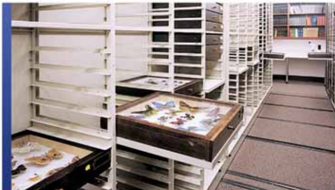
Specialized Storage for Specimens

We at Montel fully understand our responsibilities when we suggest, develop, and manufacture unique storage systems that must preserve not only priceless works of art, but also the integrity and essence of the facilities where they are located.