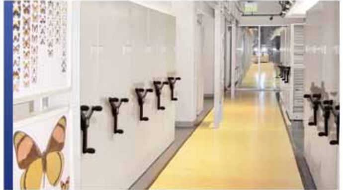
Mechanical Assist Storage

To conserve space or create new available space, our mobile storage systems offer the latest design, security and safety features to house your unique collections. With high-density powered mobile storage systems, getting the most out of your allocated space is a key consideration—but guaranteeing safety is also a must. A state-of-the-art collection-care system, SafeAisle® will put your mind at ease on both counts. Its LED Guard Technology™ is aimed at providing the utmost in storage safety, for your collections and personnel. Or, select Montel's signature Mobilex® mechanical assist storage system, with its patented mechanical safety brake, to optimize the storage footprint, while maximizing your priceless collections.