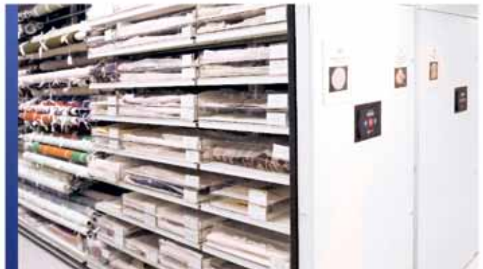
Powered Mobile Storage for Garment & Textile Collections