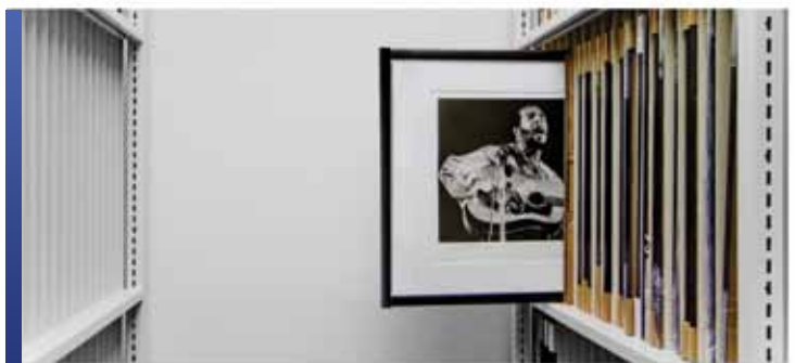
Print Collection Specialized Storage

For your distinguished works on paper ranging in dates, our extensive range of highly engineered mobile and stationary shelving storage systems offer design features and flexibility to optimize and safely conserve your treasured collections. To best accommodate the prints and drawings, drawers and trays offered in multiple configurations ensure your valuable collections are properly stored and protected for maximum conservation and security.