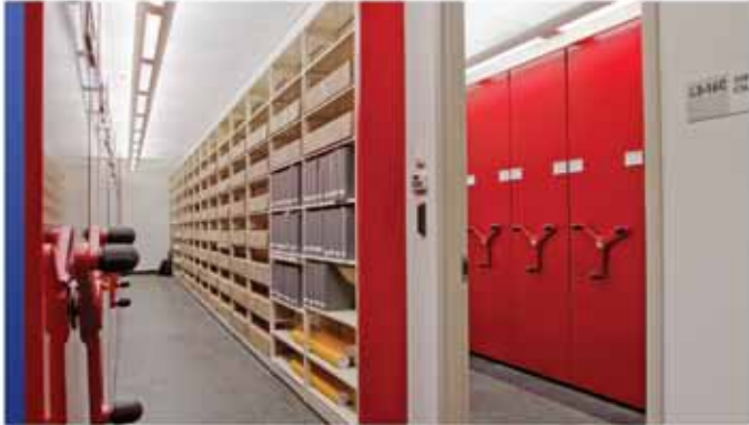
Mobile Storage for Special Collections