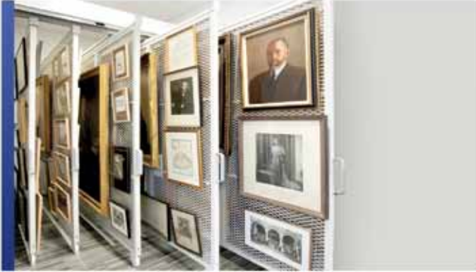
ModulArt™ Freestanding Storage Panels Kit