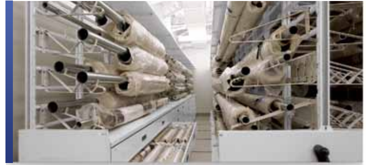
Textile Collections with Cantilever Shelving

Ranging from clothing and quilts to banners and flags, the safe and proper storage of garment and textile collections presents its own unique challenges for conservation and storage. These objects can be especially fragile as they are easily susceptible to damage from insects, moisture, and exposure to light and humidity.