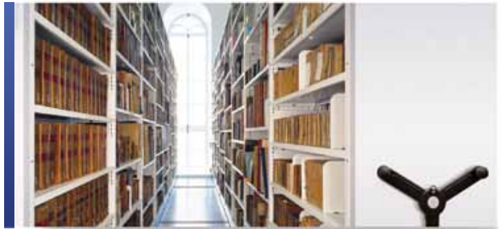
Rare Book Storage with Mobile & 4-Post Shelving

At Montel, we know that you devote the same level of care to the rare books and manuscripts in your collections. That's why we've developed the benchmark for innovative shelving to ensure that your materials in history, literature, music, the arts, science, and natural history are preserved and managed appropriately. With our specialized storage solutions, your parchments, encyclopedias, literature, poetry, novels and boxes/archives are in safe hands.