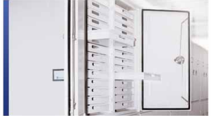
Specimens & Artifacts Storage Cabinets

Whatever your storage collections, Montel can offer a versatile array of carefully crafted cabinets designed to accommodate your special needs. With a flexible design and a wide range of options, our extensive selection of cabinets will protect your most valuable collections, ideally for use of mobile storage systems to save floor space.