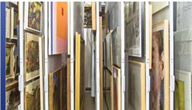
Pull-Out Storage Panels

For your painting and framed artwork collections with limited space, ModulArt™ is a stand-alone product on wheels that enables you to add more modular units as your storage needs grow. For larger areas and more permanent applications, utilize our lateral mobile storage panels or floor-mounted pull-out storage panels to optimize the use of your available space. If you prefer not to have rails underfoot or make modifications to your existing floor, opt instead for ceiling-suspended pull-out storage panels.