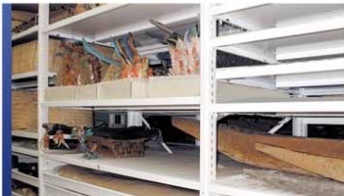
Artifact Collections with 4-Post Shelving

Whether for mobile storage solutions, or traditional stationary applications, allow us to share the unique details of Montel's exclusive shelving systems that offer superior flexibility, strength, and rigidity. No matter the shape and size, look to our SmartShelf® 4-post hybrid shelving, our Aetnastak® cantilever shelving, or our 4D wide span racking for the maximum preservation and security of your museum collections.