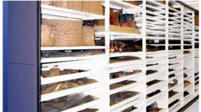
Anthropology Collections on 4-Post Shelving

We at Montel fully understand our responsibilities when we suggest, develop, and manufacture unique storage systems that must preserve not only priceless works of art, but also the integrity and essence of the facilities where they are located.