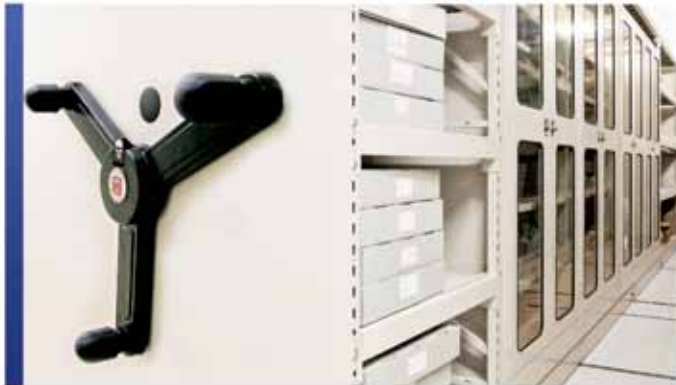
Storage Cabinets on Mobile System

Nearly 90 years of experience, along with the expertise and dedication of a team of storage conservation specialists, has given Montel its reputation of excellence as a storage systems provider for Museums, Historical Societies, Art Galleries, and Hall of Fames.