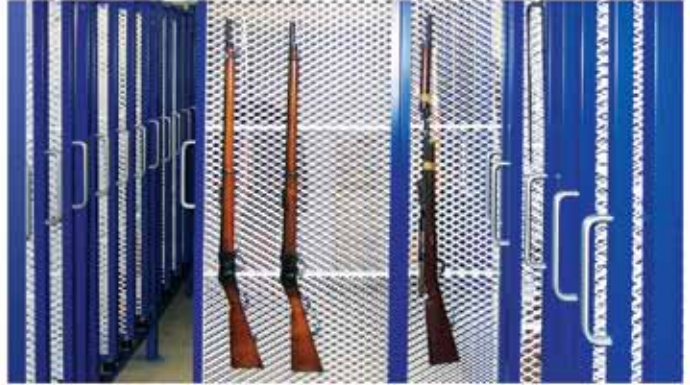
ModulArt™ Freestanding Storage Panels Kit

For your painting and framed artwork collections with limited space, ModulArt™ is a stand-alone product on wheels that enables you to add more modular units as your storage needs grow. For larger areas and more permanent applications, utilize our lateral mobile storage panels or floor-mounted pull-out storage panels to optimize the use of your available space. If you prefer not to have rails underfoot or make modifications to your existing floor, opt instead for ceiling-suspended pull-out storage panels.