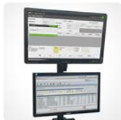
LCD and touch-screen mounts

Accessories shown here are just a sample of what we offer; visit newcastlesys.com or ask your salesperson for a complete list.