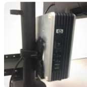
Thin client and CPU mounts